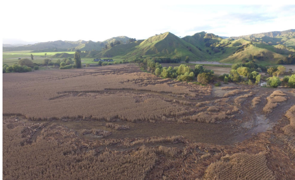
Cyclone Gabrielle impact in Tairāwhiti: Farmers are not able to harvest fields littered with logs and woody debris.