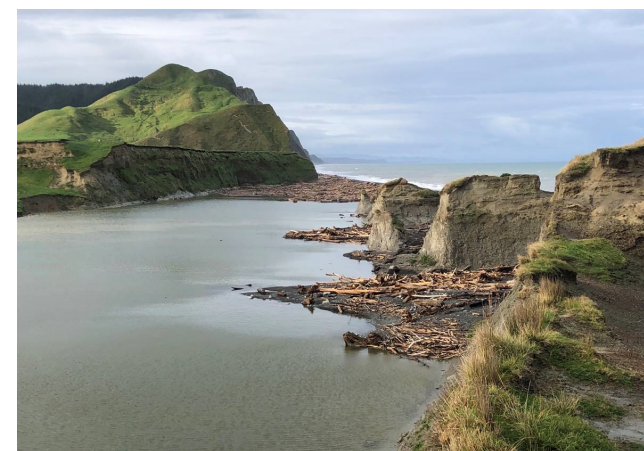
Debris and erosion at Waihua River Mouth.