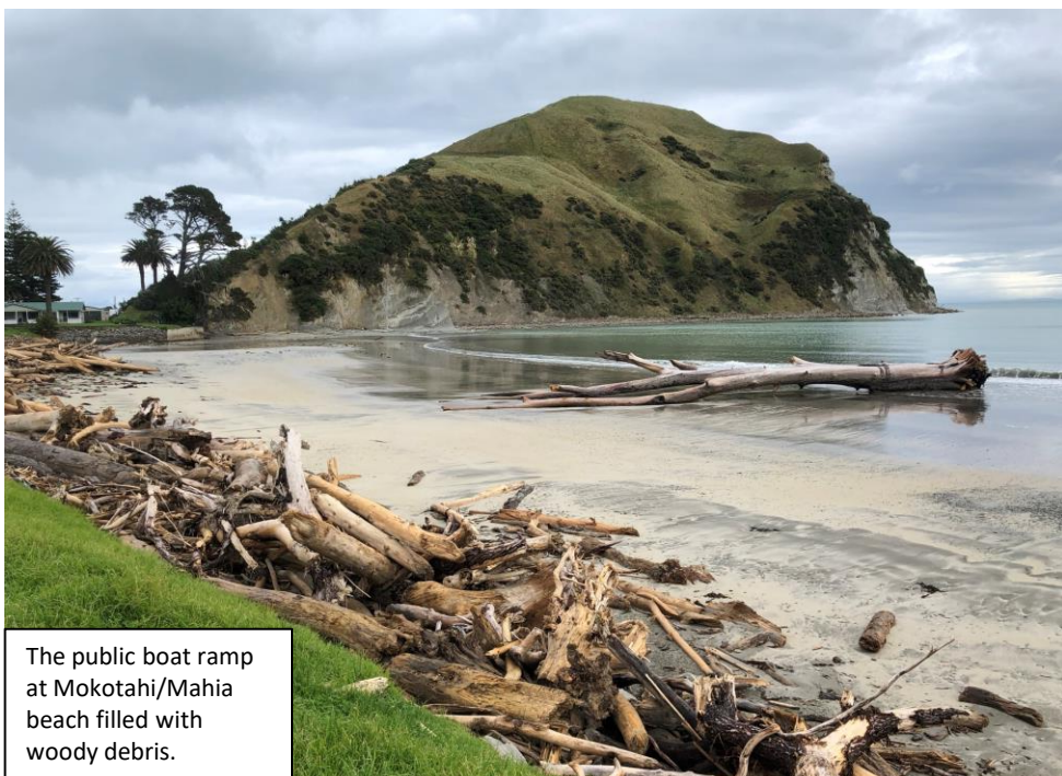
The public boat ramp at Mokotahi/Mahia beach filled with woody debris.