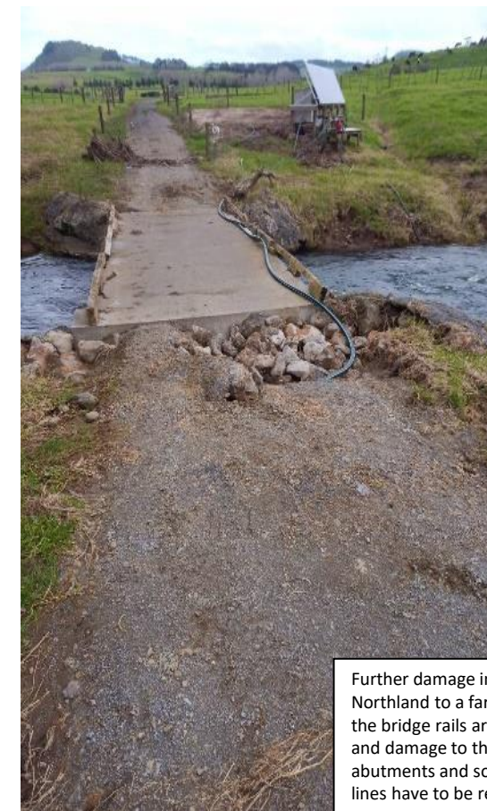
Further damage in Northland to a farm track – the bridge rails are all gone and damage to the abutments and some water lines have to be repaired.

T&G Global has forecast a pre-tax loss of $28 million to $34 million this year, after assessing damage from Cyclone Gabrielle.