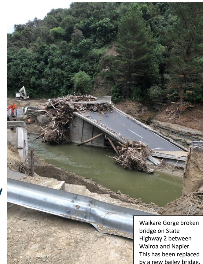
Waikare Gorge broken bridge on State Highway 2 between Wairoa and Napier. This has been replaced by a new bailey bridge.

MPI has estimated that 100 horticulture and arable growers in Hawke's Bay and Tairāwhiti, totalling around 4,900 hectares, were heavily affected by the cyclone.