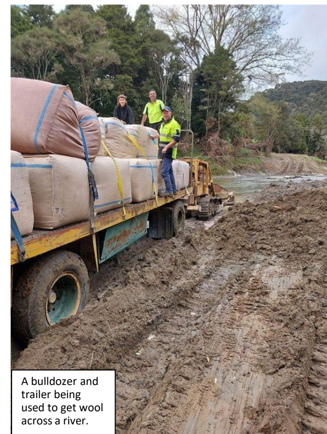
A bulldozer and trailer being used to get wool across a river.

On 3 May the Government announced significant financial support to assist with removal of cyclone-related sediment and debris in Hawke's Bay and Tairāwhiti.