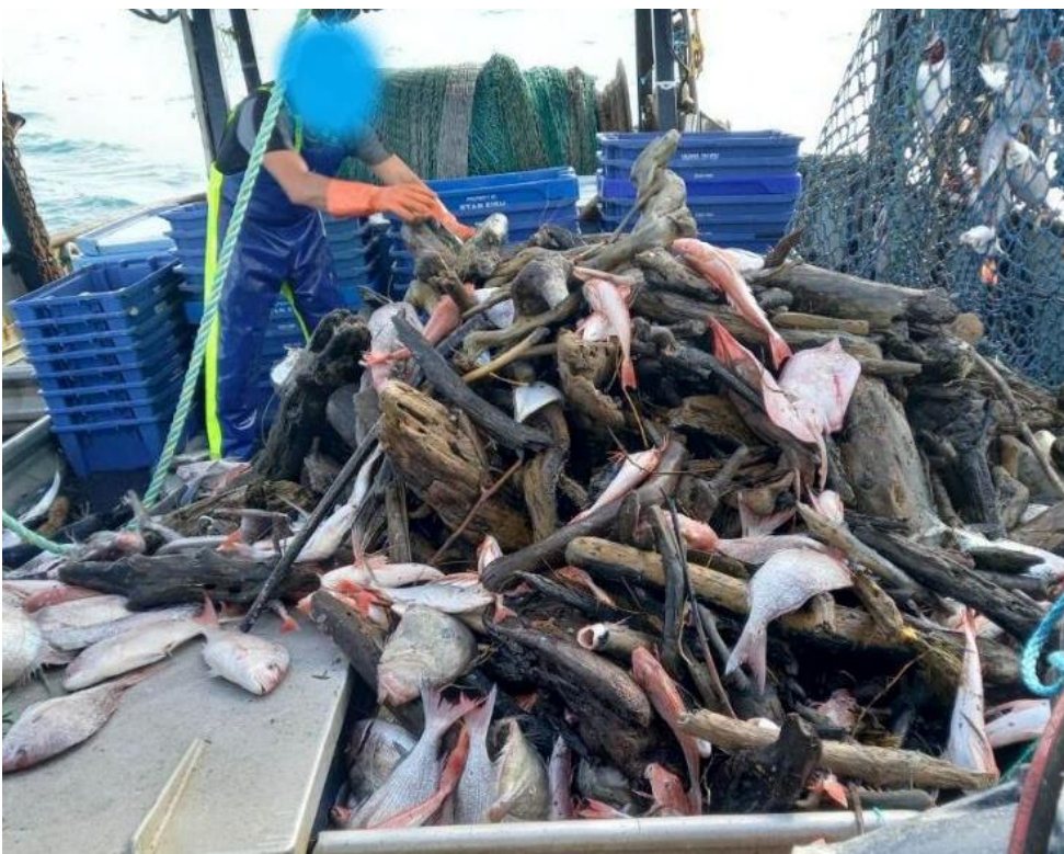
The image shows a trawler in Hawke's Bay with its catch from around 60 metres deep. Lots of woody debris in the catch cause damage to fish and lower catch volumes.