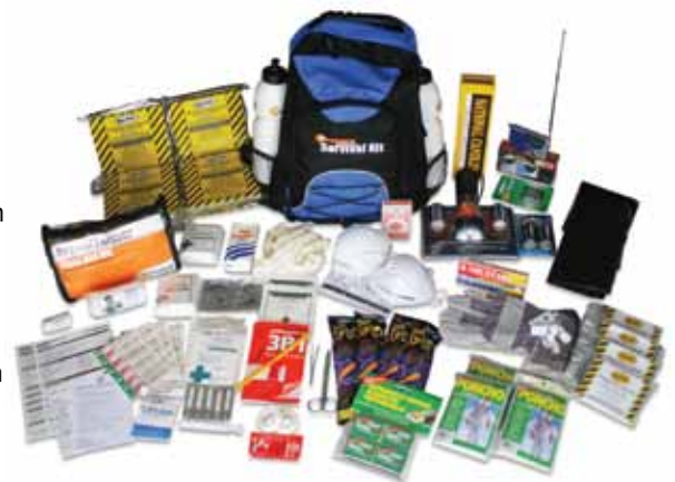
As part of the preparedness drive, staff have the chance to win a four-person 72-hour survival kit.

To encourage engagement, Fonterra’s Health & Safety Committee is also giving away a few spot prizes to staff including four-person 72-hour survival kits, if they send in their completed Household Emergency Plan and Checklist. ■