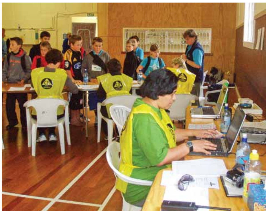
Staff undertaking a Welfare Centre training exercise in Thames Coromandel.

Other literature that will be considered includes all available Canterbury earthquake response debriefs; all relevant legislation that defines agency mandates, roles and responsibilities; current welfare arrangements in all CDEM groups; the MCDEM-commissioned review of the February