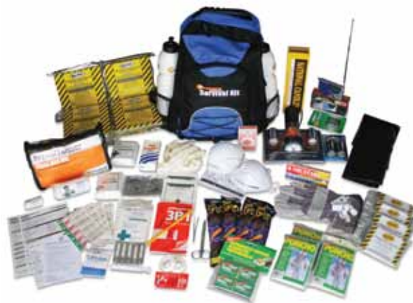
As part of the preparedness drive, staff have the chance to win a four-person 72-hour survival kit.

To encourage engagement, Fonterra’s Health & Safety Committee is also giving away a few spot prizes to staff including four-person 72-hour survival kits, if they send in their completed Household Emergency Plan and Checklist. ■