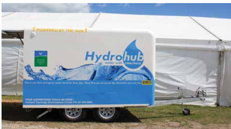
The hydrohub water treatment trailer on site at the Oiled Wildlife Response Centre in Te Maunga where it is providing clear water for those assisting in the Rena grounding clean-up.

The official launch took place on Friday 14 October in Tauranga. Little did anyone know the unit would be put to immediate use in an emergency response. Initially deployed to provide drinking water for the volunteers involved in the beach clean-ups in response to the Rena grounding, it is now based at