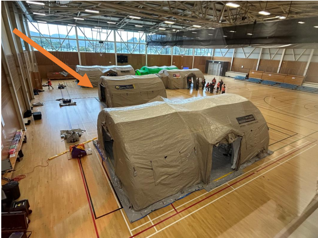
Pictures above and below point to the Grey District inflatable shelter, setup alongside four others from West Coast Emergency Management, St John and FENZ in August 2025.