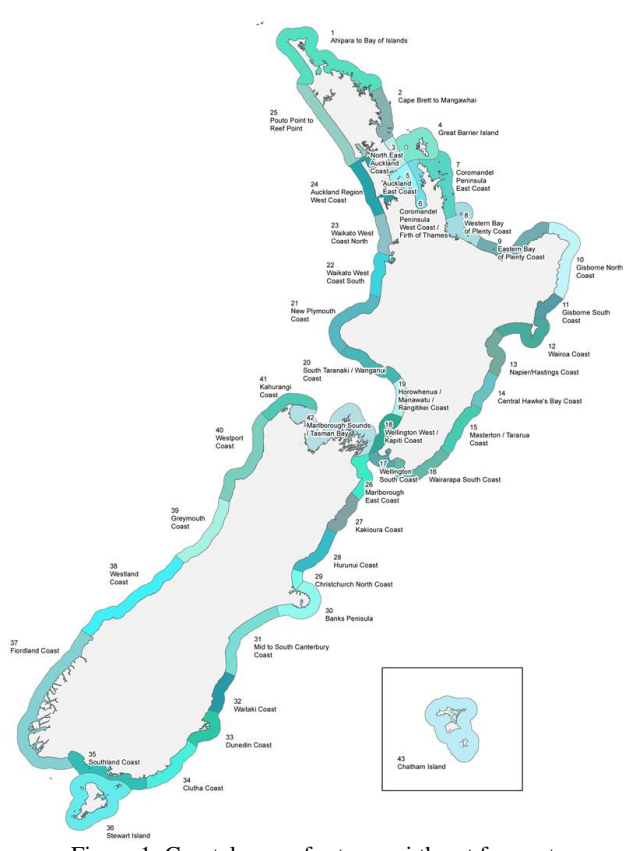
Figure 1: Coastal zones for tsunami threat forecasts