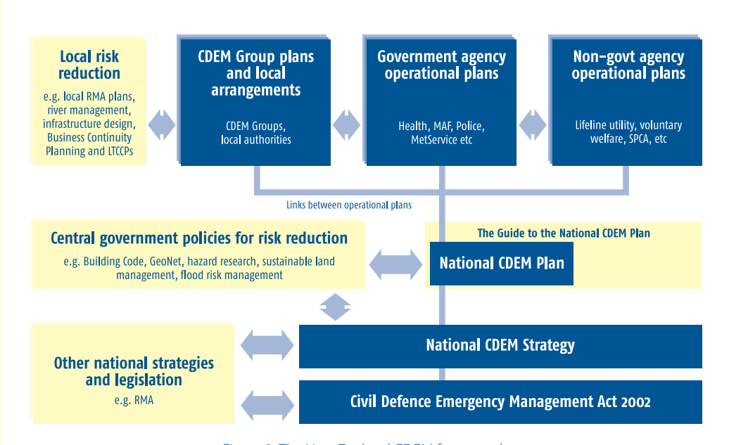
Figure 2: The New Zealand CDEM framework

This Strategy is one part of the CDEM framework in New Zealand. The CDEM Act 2002 (the Act), the Strategy, the National CDEM Plan (the Plan), the Guide to the National CDEM Plan (the Guide) and CDEM Group plans all form part of the framework, with the support and participation of central and local government, emergency services, lifeline utilities, other general infrastructure providers, businesses and volunteer agencies who are implementing the CDEM arrangements. These arrangements are illustrated in Figure 2.<sup>2</sup> To achieve a Resilient New Zealand , local and regional cooperation and coordination is paramount and is one of the cornerstones of the Act, Strategy and Plan and Guide.