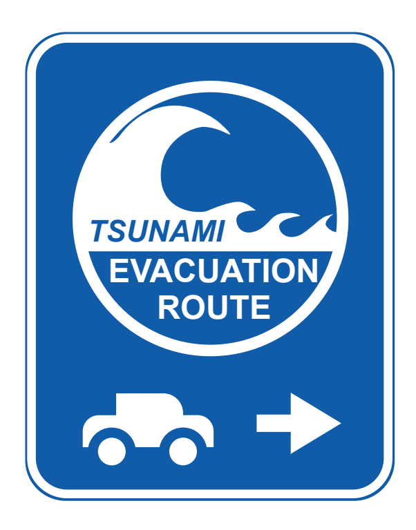
Figure 7: Tsunami evacuation driving route sign

The driving tsunami evacuation route sign is employed for routes where evacuation by vehicle is the most appropriate means of leaving the threatened area in the time available.