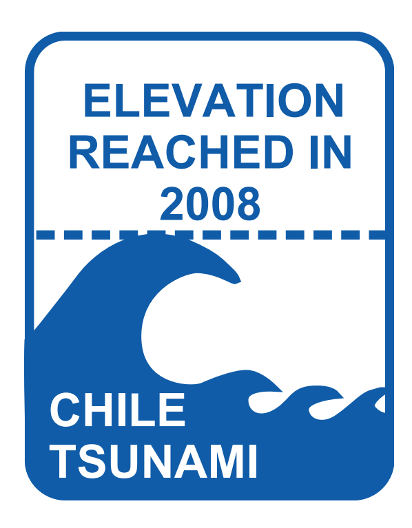
Figure 11: Previous event sign

The message on the sign should be simple, clearly stating what event is represented (historic, maximum credible, etc.). See example below.