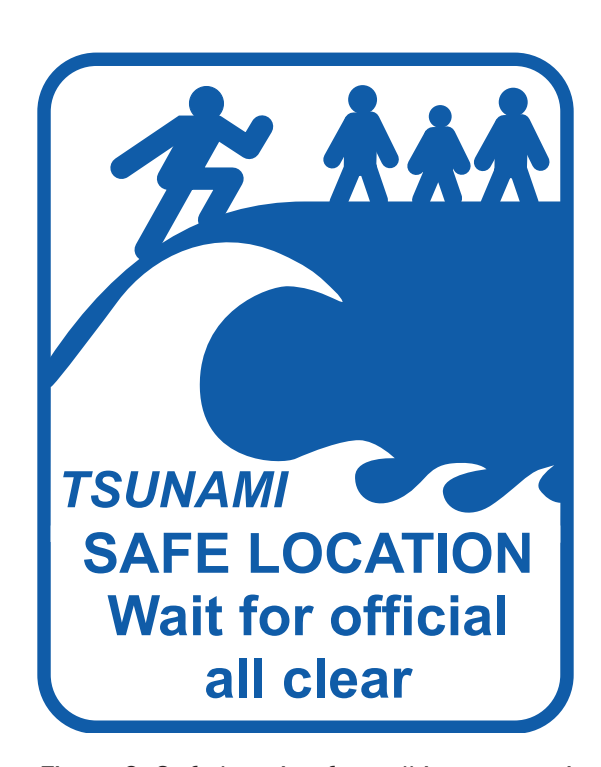
Figure 9: Safe location for walking evacuation routes sign