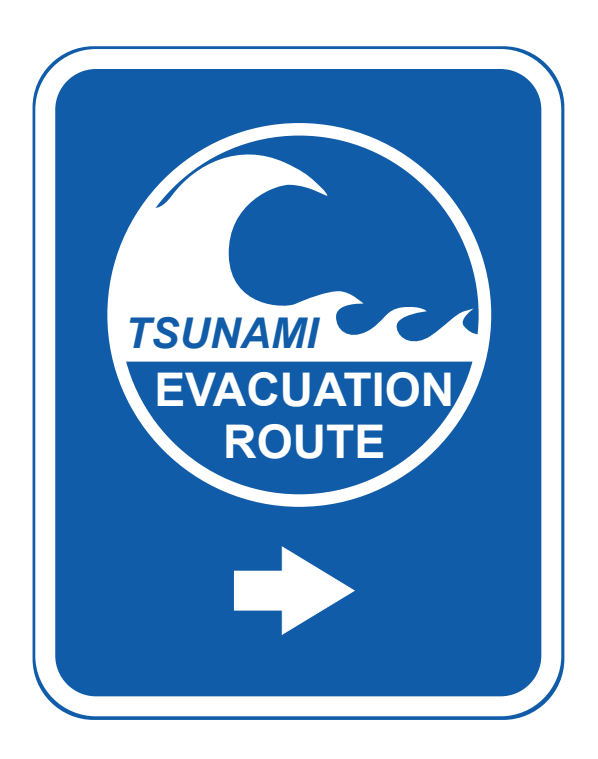
Figure 5: Generic tsunami evacuation route sign

The generic tsunami evacuation route sign can be employed to guide both pedestrian and vehicle evacuation although the sign is considered a traffic sign and is designed to meet the requirements of those regulations and be easily understood by travelling vehicles.