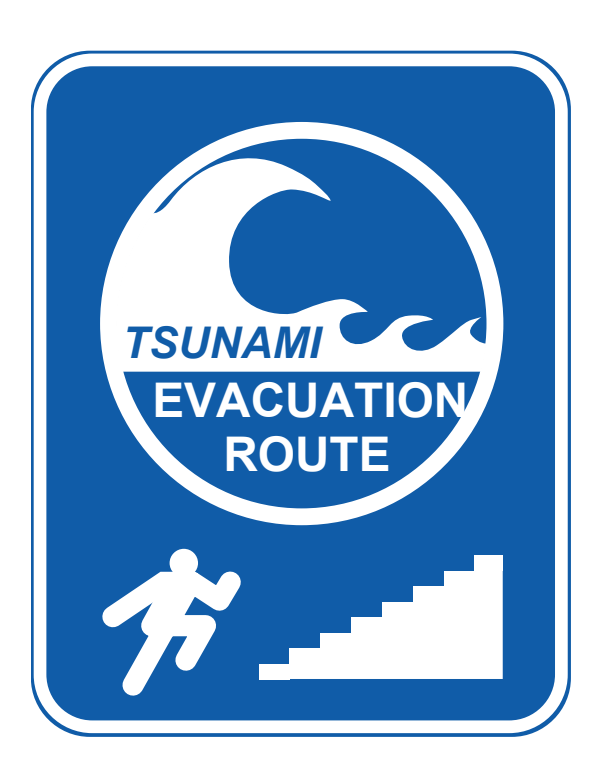
Figure 8: In-place vertical tsunami evacuation route sign

In-place vertical tsunami evacuation route signs are to be employed indoors or outdoors where the most appropriate means to escape the threatened area by climbing to higher elevation at that location.