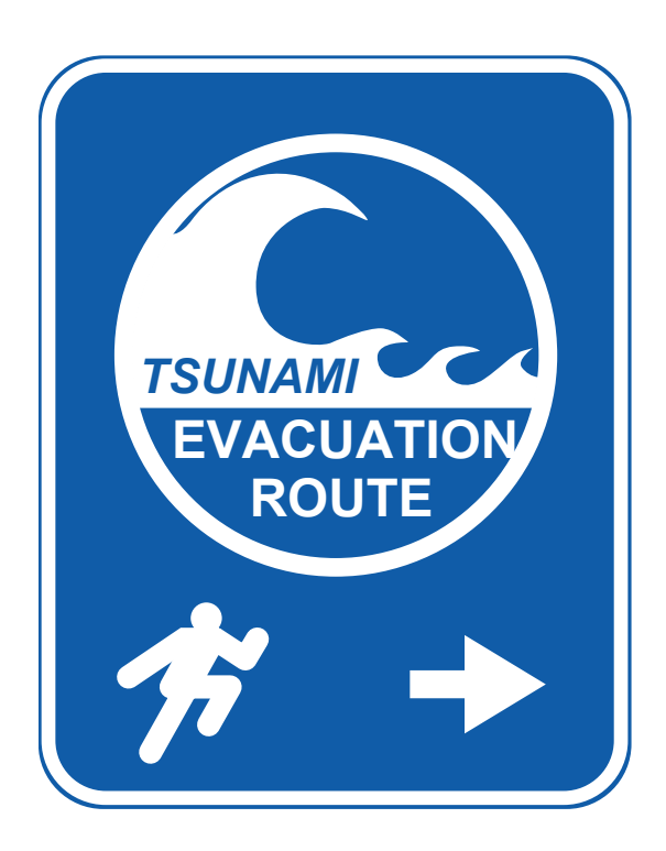
Figure 6: tsunami evacuation walking route sign

The walking tsunami evacuation route sign is employed for routes either suitable only for travel by foot or that provide a route where travel by foot is the most appropriate means to leave the threatened area.