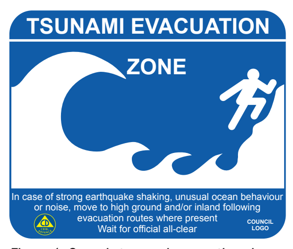
Figure 1: Generic tsunami evacuation sign

For local authorities where long duration earthquake generated tsunami pose a threat, the direction to the public on the sign can be "In case of strong or prolonged earthquake shaking, unusual ocean behaviour or noise, move to high ground and/or inland following evacuation routes where present. Wait for official all clear."