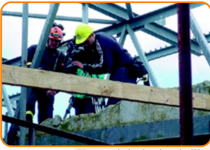
TV3 crews capturing the action at the exercise which was held at the end of the Category 2 USAR technician course in October.

A successful Category 2 USAR Technician course was held in Palmerston North from 8 to 26 October, involving personnel from the Fire Service, Police, Ambulance, Defence, Local Government, search dogs, and an engineer. This course is the first step in reestablishing the Palmerston North USAR Unit up to fully functional status. The lessons learnt from this first Cat 2 course will be used to develop further courses, initially in Christchurch in the first half of next year.