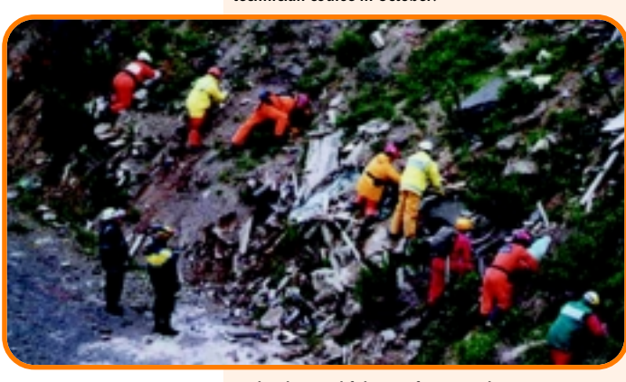
Under the watchful eyes of USAR Task Force members Bernie Rush and Royce Tatham, students conduct a line and hail search at the C & D Landfill in Wellington during the USAR Awareness pilot course.