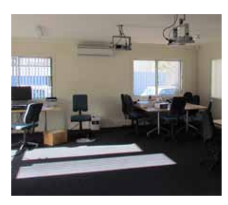
Left and above: Inside and outside of the new ECC.

In the February 22 earthquake the buildings surrounding the Canterbury Civil Defence Emergency Management Group Emergency Coordination Centre (ECC) were severely damaged meaning that it could no longer be used. As a result the ECC moved out to the NZi3 building at Canterbury University before being combined with the Christchurch City Council in the nationallyled Christchurch Response Centre in the Christchurch Art Gallery.