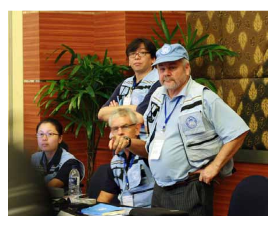
Above: UNDAC Team members take part in the Asia Pacific Earthquake Respose Exercise

These exercises rotated between earthquake disaster prone countries in the Asia Pacific region provide a valuable tool for disaster management authorities and the international humanitarian community to interact and practice common methodologies. During this particular exercise new USAR standard operating procedures and forms were used for the first time. These are now being evaluated and will, where appropriate, be incorporated into the next change to the INSARAG Guidelines. For the UNDAC and USAR teams it provided valuable learnings when responding to an