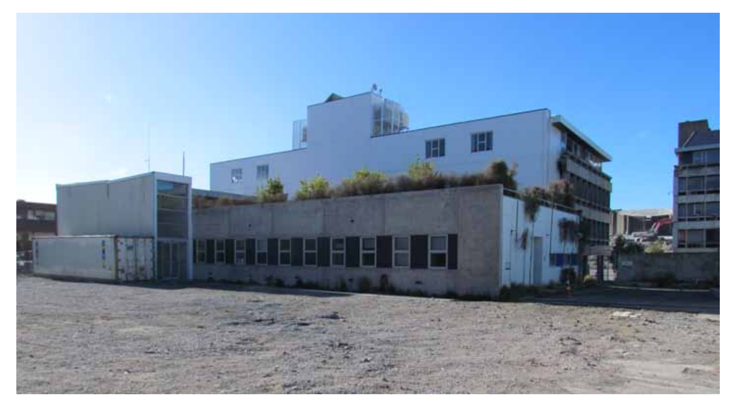
Above: The old ECC with cleared site of one of the previous ECan buildings that has been deconstructed.

The office moved into these new building on the 24<sup>th</sup> of May in time to activate the ECC on the 29<sup>th</sup> and 31<sup>st</sup> for the Canterbury Groups annual Exercise Pandora. This year's exercise focused on a snow storm and heavy rain emergency across the region with the EOCs practicing sharing and movement of EOC staff from one to another. Over the next few months we look forward to settling in to the new office and getting it prepared for any emergency activations.