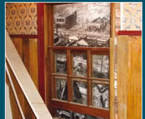
1931 exhibition opens - P4