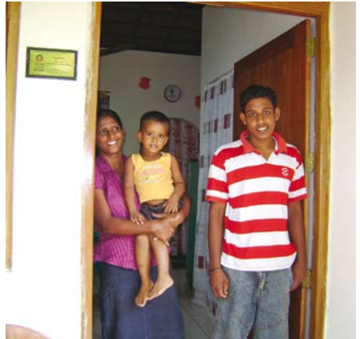
Above: A very grateful family photographed in a recently completed home. The plaque acknowledges Operation Phoenix North Shore City.

Lyn has prepared oral histories of the people involved in Operation Phoenix North Shore and has arranged displays in Takapuna Library. She was also closely involved in the organisation of the photo exhibition. Lyn is taking every