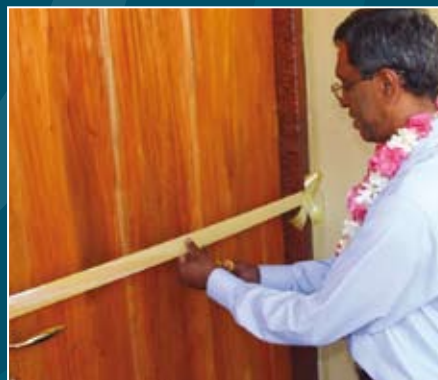
Operation Phoenix North Shore - P8