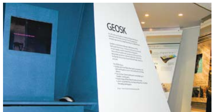
Below: GNS Science has provided a new GEOSK which displays live earthquake data via the internet.