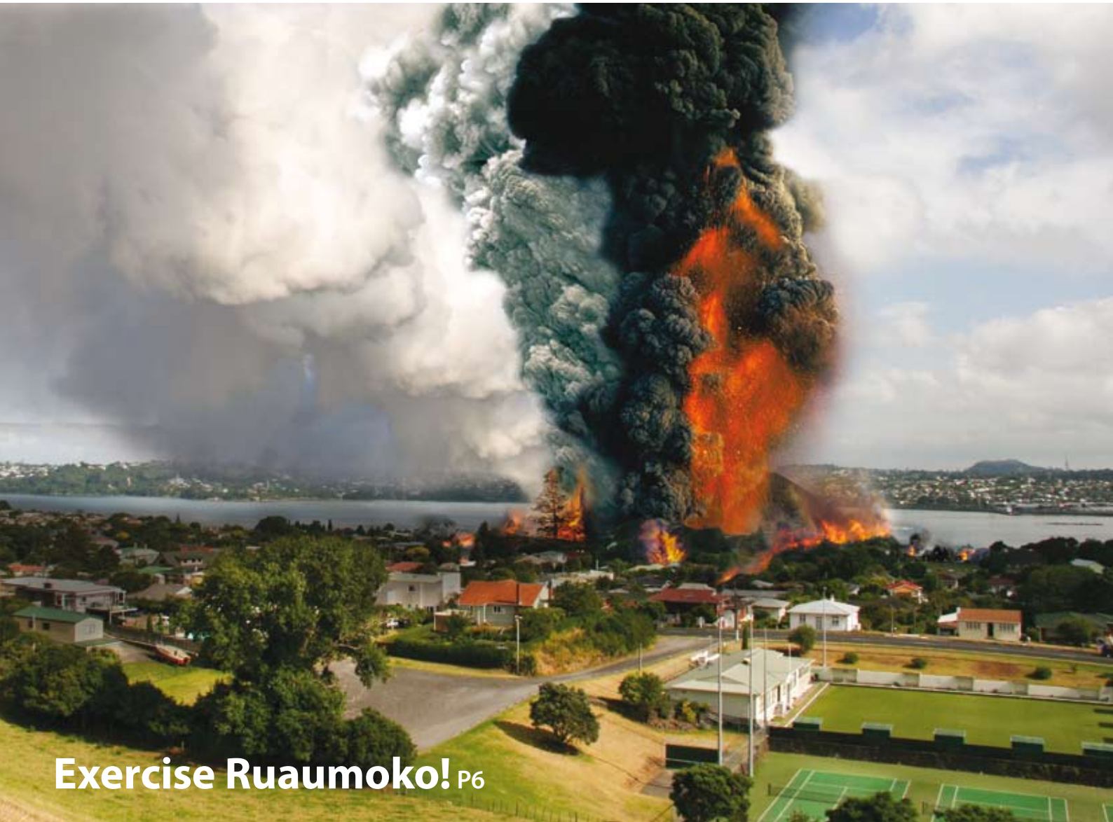
Exercise Ruaumoko! P6