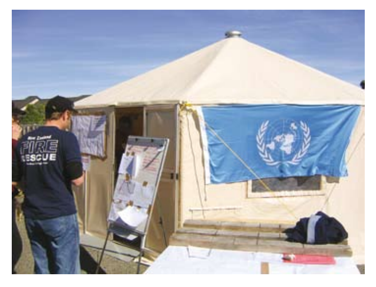
(Above) Participants involved in various UNDAC training exercises held recently in Christchurch. (Right) Airport security simulation at Christchurch airport.

which were jointly funded by NZAID and the Australian Agency for International Development (AUSAID). The On-Site Operations Coordination Centre Course (9-11 October) and the UNDAC Induction course (14-26 October) involved more than sixty participants from twenty four countries.