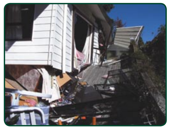
Landslides caused extensive damage to some properties.

and Nuclear Sciences Ltd reports that "swarms of small shallow earthquakes are reasonably common in the Bay of Plenty." However, "this swarm was slightly unusual in that the magnitudes of the largest earthquakes were bigger than normal. We see this type of swarm perhaps once every decade in the Bay of Plenty" says Dr Gledhill.