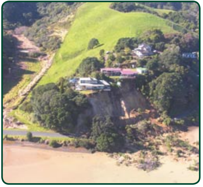
Landslides in Ohiwa Bay caused significant damage to homes and infrastructure

On Saturday 17 July 2004 at approximately 17:00, Opotiki District Civil Defence declared a state of civil defence emergency for the Waitaki Ward. Later that evening, Whakatane District Civil Defence declared for the Whakatane urban area at 21:47. The Environment Bay of Plenty regional council consulted with the affected districts and decided not to make a regional declaration.