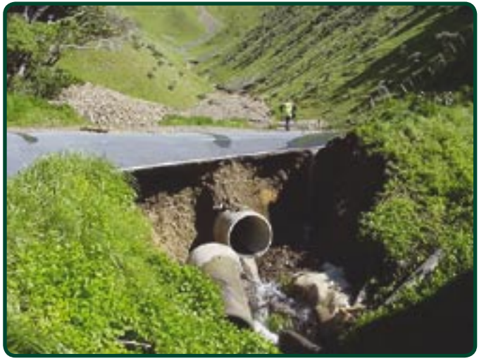
Above: Storm damage on the Paekakariki Hill Road Left: Cleaning up homes contaminated by sewage and floodwater.