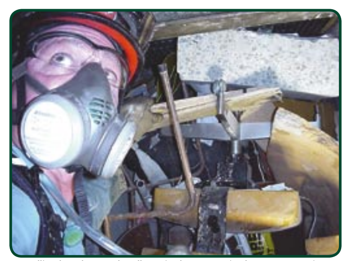
Tunelling through a pancake collapse simulator to exercise the rescue process in an apartment building collapse scenario.

The taskforce support course also included the first doctor to train with New Zealand taskforce groups – Dr Tony Smith from Auckland.