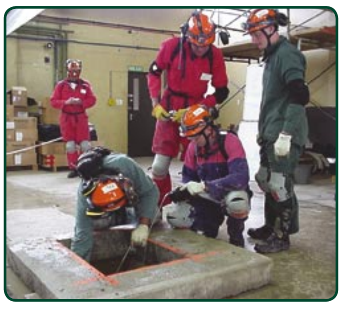
Taskforce technicians using atmospheric monitoring equipment to check air quality before entering a confined space.

Although each support team member has specialised skills, all have been cross-trained in at least one other specialist area and many are able to undertake multiple tasks within the taskforce support structure. The introduction of support staff is a major step forward for the NZ USAR project and greatly enhances our national capability.