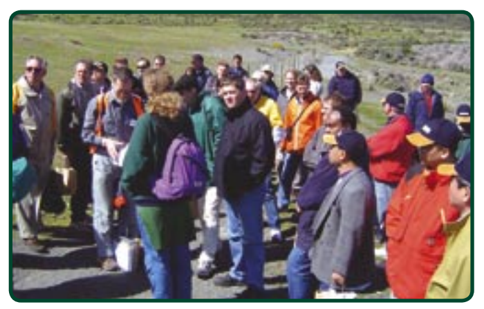
Delegates on a coastal Wellington field trip stop to look at the raised beaches of past earthquake events near Cape Turakirae, just east of the entrance to Wellington Harbour.

Between 29 September and 3 October 2003 the Ministry hosted the five-day ITSU XIX Conference in Wellington. It was a UNESCO / IOC organised meeting for the signatory countries involved in the Pacific