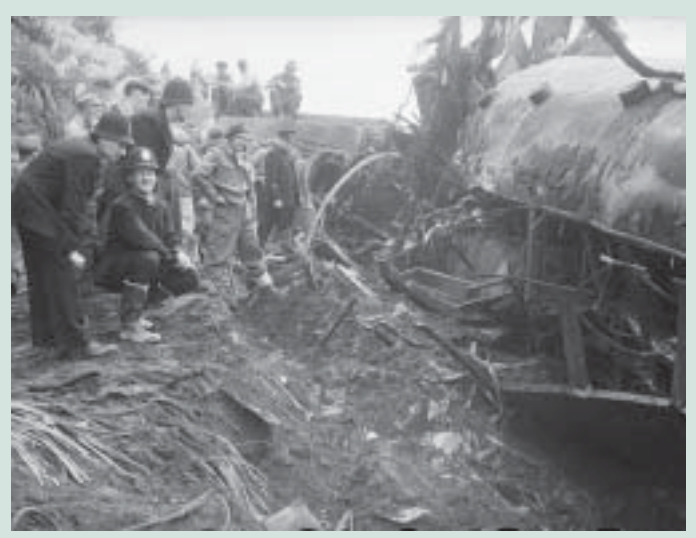
Rescue party at wrecked carriage of the Wellington-Auckland express.

At the time, Tangiwai was the eighth biggest railway disaster the world had seen. It is still the fifth worst disaster in New Zealand's recorded history.