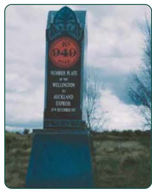
The Tangiwai monument at the memorial site which was established in 1989.