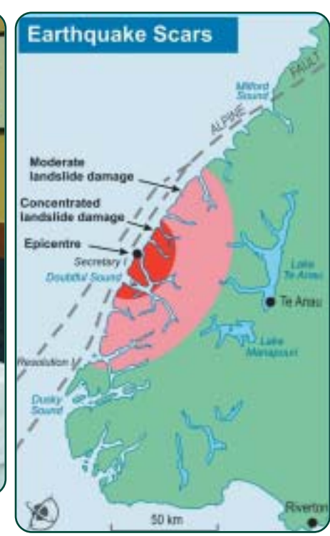
The 7.1 quake in Fiordland triggered more than 400 landslides.