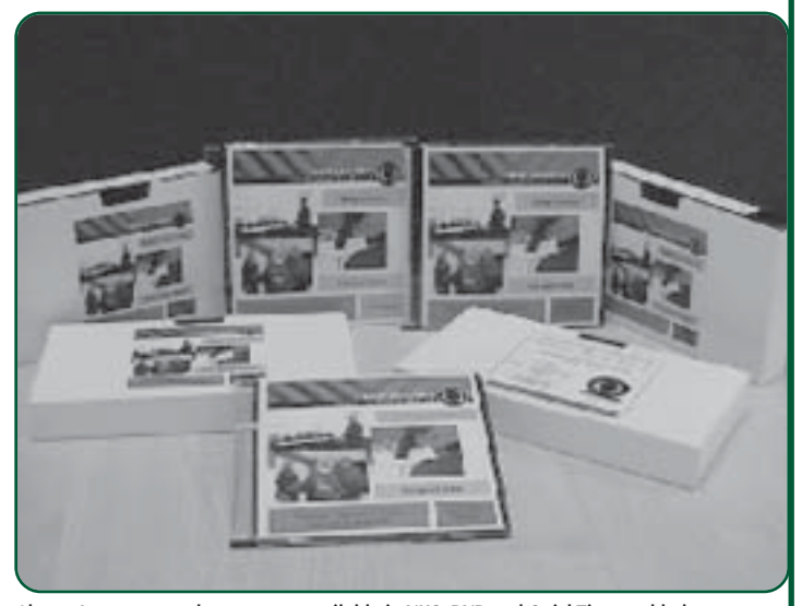
Above: Lesson exemplars are now available in VHS, DVD and QuickTime and help prepare students for their General Rescue Trainer Assessment.