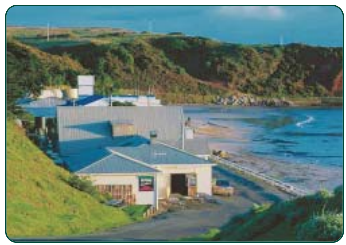
Hotel Waitangi and fish processing facilities behind Waitangi township

The islands also form a vital part of the Pacific Tsunami Warning system with a tide gauge and tsunami data collection platform installed off the wharf at Waitangi. Data from this equipment is transmitted by satellite to Hawaii and forms part of the wider network and warning system within the Pacific.