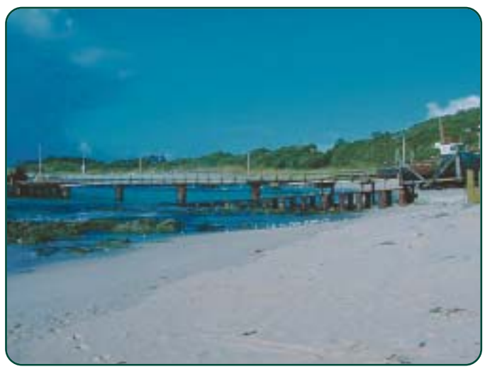
Kaingaroa wharf on the east side fo the island. First point for New Zealand of a South American generated tsunami.

The Chatham Islands Council was formed in 1901 with the first council elected in 1925.