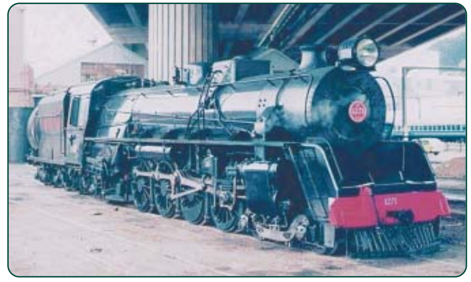
JA1271 will do the commemorative run from Palmerston North to Tangiwai on 21 December. The steam locomotive is one of the ex-New Zealand Government Railways locomotives that has been restored by Steam Incorporated Inc. In 1998 the society was awarded the A&G Price Restoration Award, for the second time, for their efforts in restoring JA1271 for main line operation.