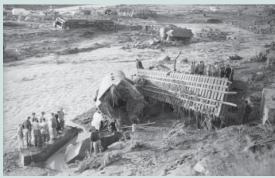
The wreckage of the Wellington - Auckland express and the remains of the railway bridge at Tangiwai. 25 December 1953. Alexander Turnbull Library, Wellington, New Zealand Reference: Morrie Peacock Collection PAColl-4875, 59.10

The commemoration ceremony at Tangiwai will commence at