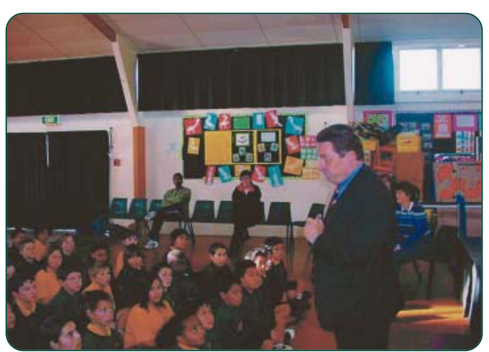
A captive audience at the Cosgrove School in Papakura.

As part of a school project on "Disasters", the Minister had been invited to speak to Year 5-6 students on the topic. The Minister talked about the different types of disasters and how to be better prepared for them. He fielded many enthusiastic questions but one, "can you surf on a tsunami?" however caught him somewhat "unprepared".