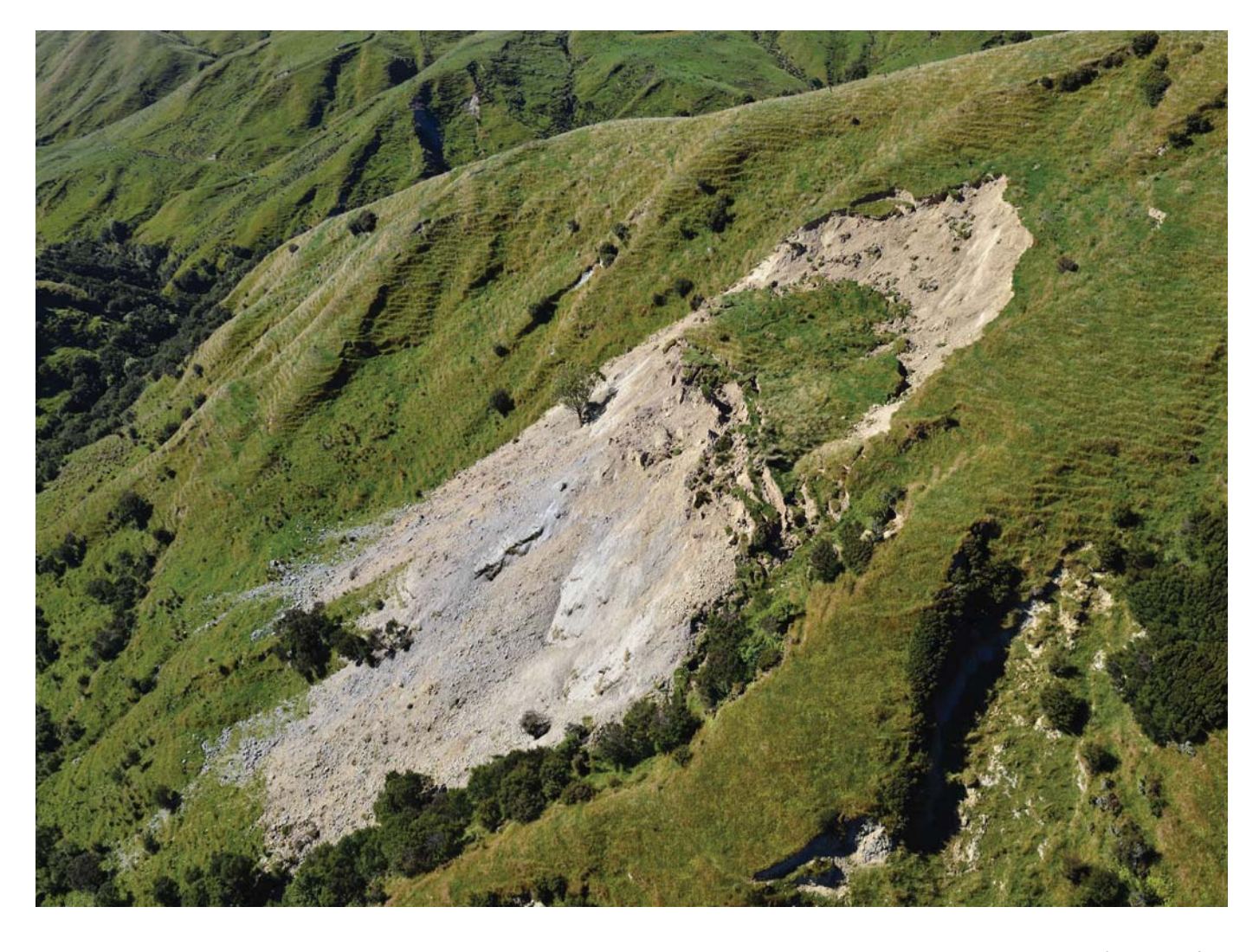
Photo: A large landslide in the Puketoi Range Foothills following the January 2014 Eketahuna earthquake.

Please send in reports to: landslides@gns.cri.nz ■