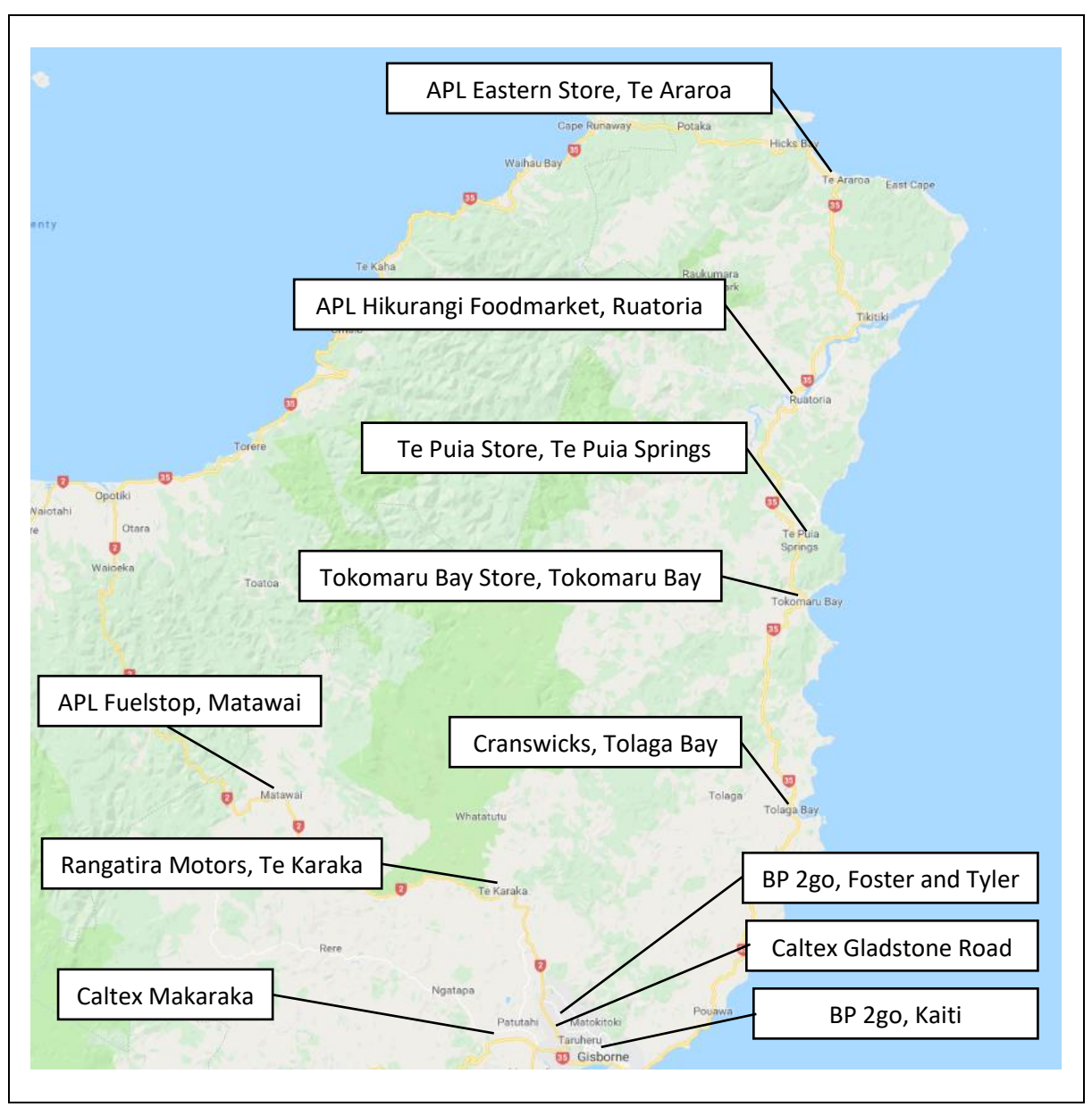
Figure 2: priority service stations

(Use the CDEM contacts list for contact details.)