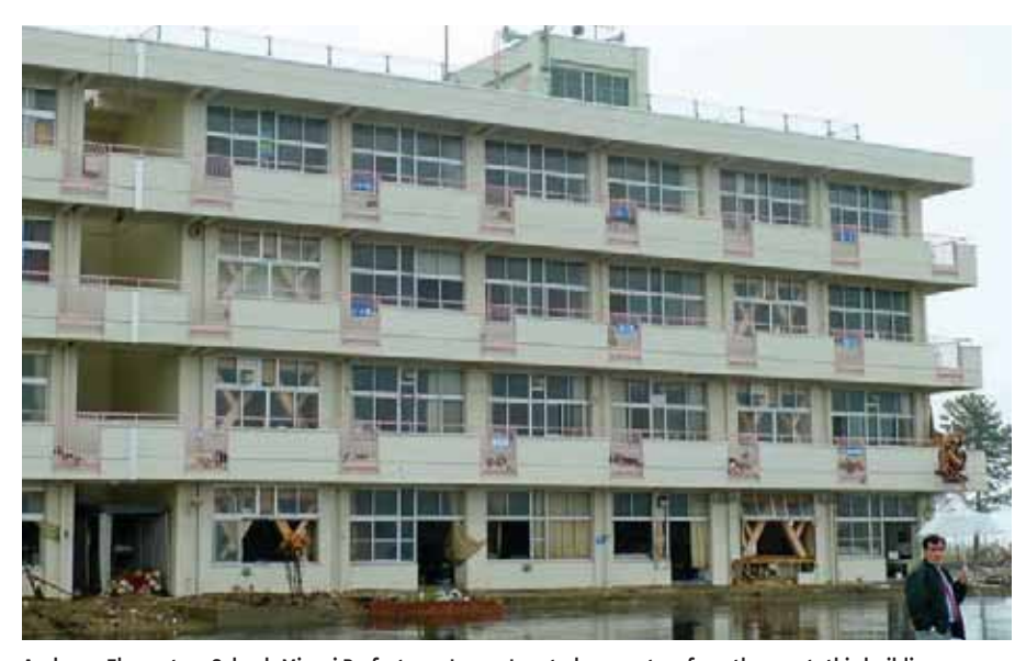
Arahama Elementary School, Miyagi Prefecture, Japan. Located 750 metres from the coast, this building was successfully used as a refuge for 380 schoolchildren and surrounding residents in 7.5-metre deep inundation. The building suffered non-structural damage from water flow and debris impact.

earthquake and tsunami provides valuable insight into the performance of structures used as evacuation refuges. These include buildings that were designed specifically for expected tsunami loading and evacuation, and some that were used as refuges but had not been specifically designed.