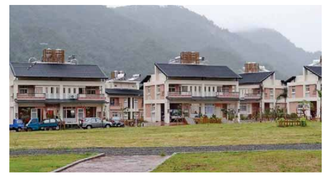
New Siaolin Community in Wulipu Village (funded by Red Cross). The Siaolin Village landslide killed 407 people.

The challenges Taiwan faced for recovery included: the management of the large amount of debris (with road access already impaired); significant loss of land on slopes and riverbeds; isolated villages and continued reoccurrence of villages being cut off during typhoons and heavy