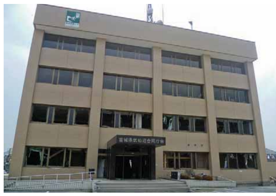
Example of a successful designated tsunami evacuation building in Kesennuma, Miyagi Prefecture, Japan. This office building was inundated to a height of 8 metres and sustained minor scour and non-structural damage. Videos show that people survived on the roof of this building.

A recent field visit to the Tohoku region of Japan following the March 11, 2011