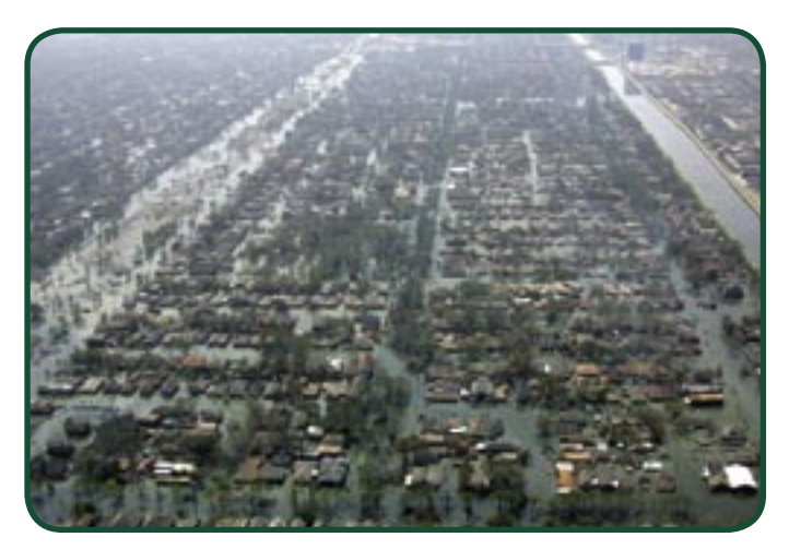
The Katrina flooding left 90% of New Orleans under water