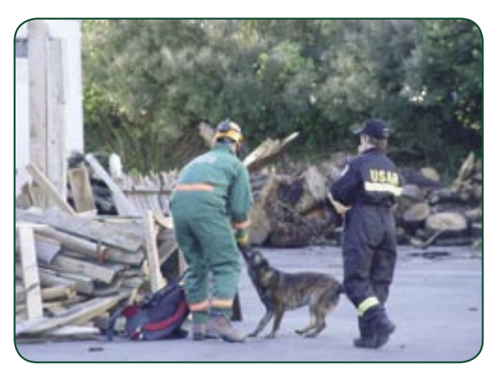
This dog has just alerted to a person trapped in the rubble.

exercise was a huge success" and the Search Dog Association have scheduled a second event for next year.