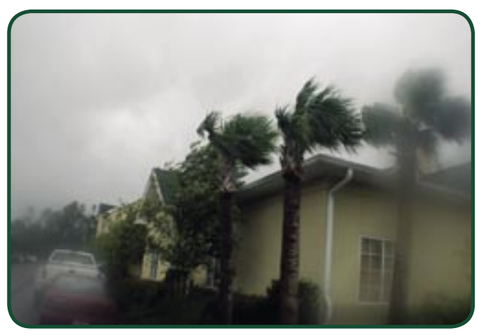
The hurricanes brought incredibly high winds and rain in Florida.