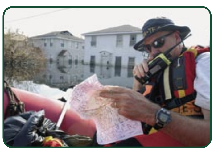
At the height of the flooding, boats were the only way to rescue stranded citizens.