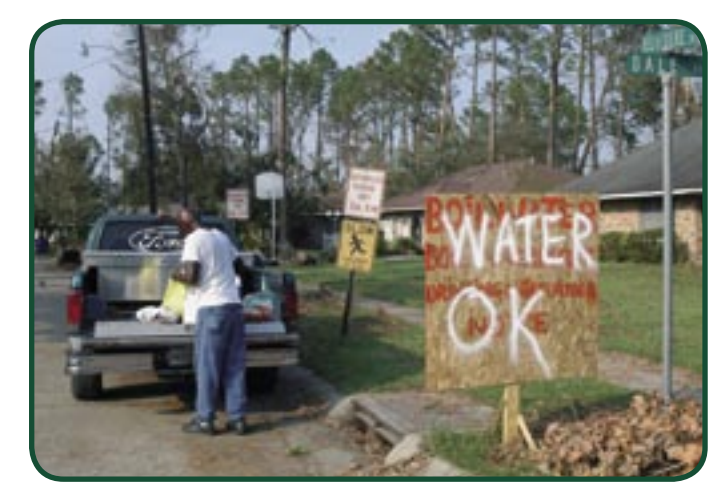
Residents alerted others that water was suitable for drinking.

Though he has almost 20 years' experience in emergency management, including deployments to Sri Lanka following the Boxing