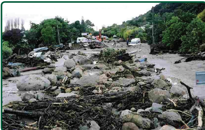
Matata Edgcumbe intersection

Matata experienced not only flooding but landslides of mud, trees and huge boulders. One house – with four people in it – was picked up by surging floodwater and swept 300 metres. The streams at each end of the town broke their banks. Fourteen cars were swept into the lagoon and a house and several cars were washed on to the railway tracks. The town was closed to all but emergency services.