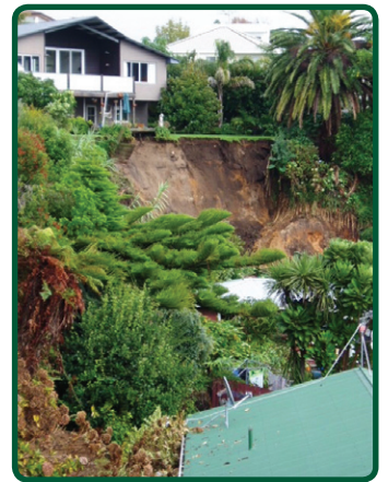
Slips and damaged properties in Karaka Road in Tauranga

Matata experienced not only flooding but landslides of mud, trees and huge boulders. One house – with four people in it – was picked up by surging floodwater and swept 300 metres. The streams at each end of the town broke their banks. Fourteen cars were swept into the lagoon and a house and several cars were washed on to the railway tracks. The town was closed to all but emergency services.