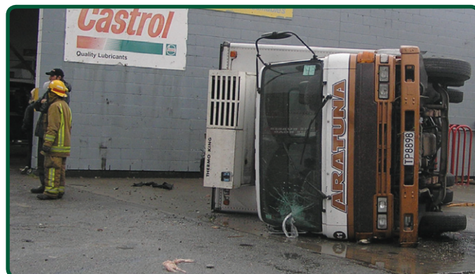
The tornado picked up this Atahuna Transport truck and flung it on its side.