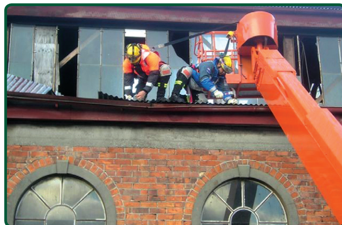
The last phase of tidying up the iron roofing on the north face of the historic Dispatch and Garlick building.

Civil defence emergency management staff were alerted and partially activated. Staff monitored the work going on and used CDEM processes to gather information.