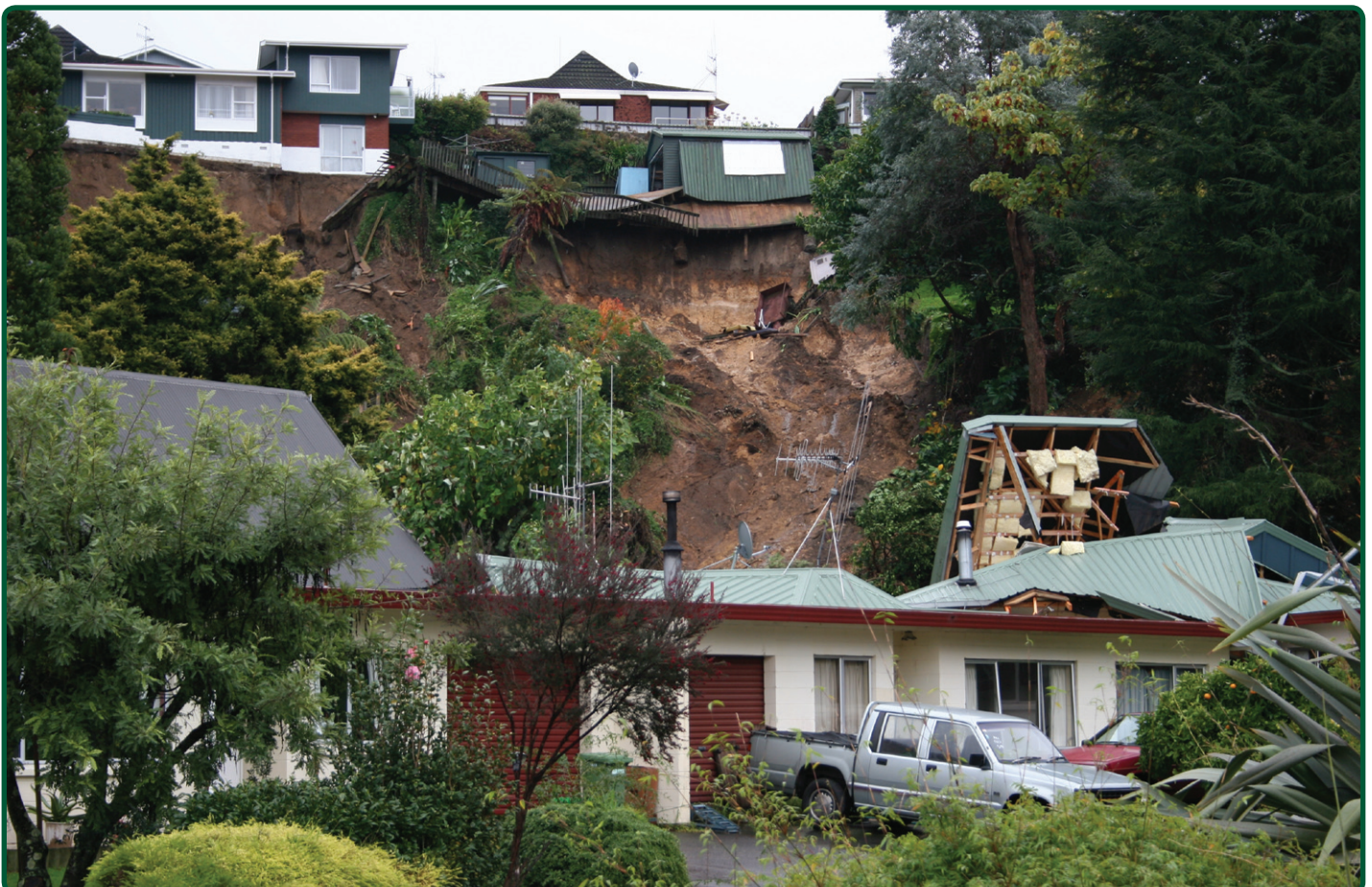
The deluge on 18 May resulted in a number of landslides and significant damage to properties on Landscape Road in Tauranga.