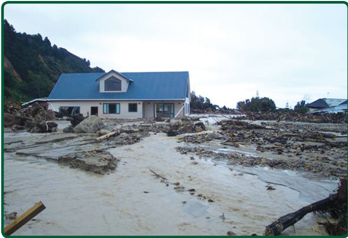
Flood damage in Matata

In both areas, damage was extensive and severe, to housing, roading and sewage and stormwater systems. At least 17 local roads in Tauranga and 10 in Matata were damaged, as well as SH2 and the railway line at Pikowai (Matata Straights) and the bridge at Hauone. Power, telephones and water supplies were disrupted.