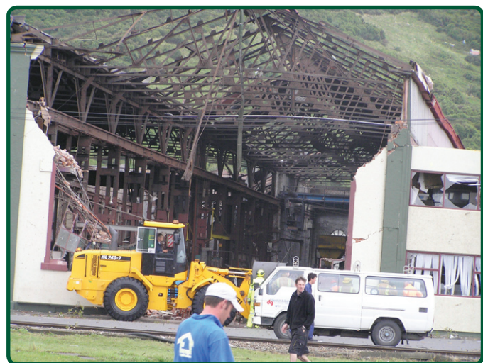
The west wall of the Grey Foundry, where the tornado entered the building.