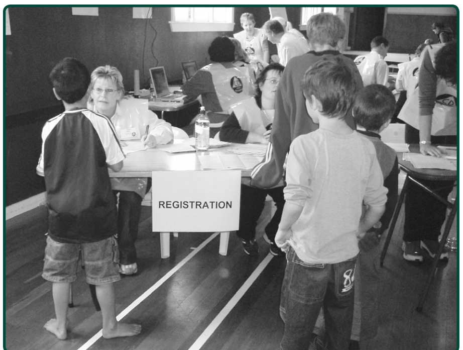
Students at the TePuru School took part in the exercise