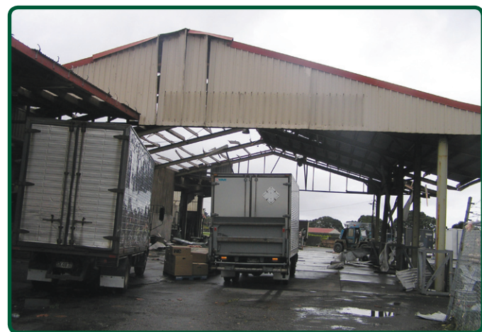
The roof of the TransWest Transport Loading Bay was extensively damaged.