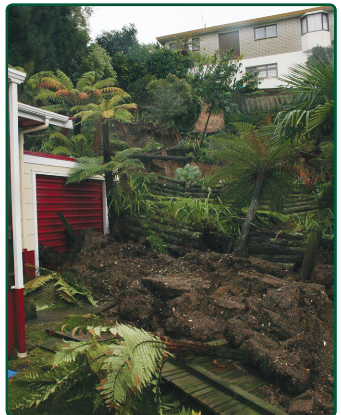
Damage to properties in Tauranga