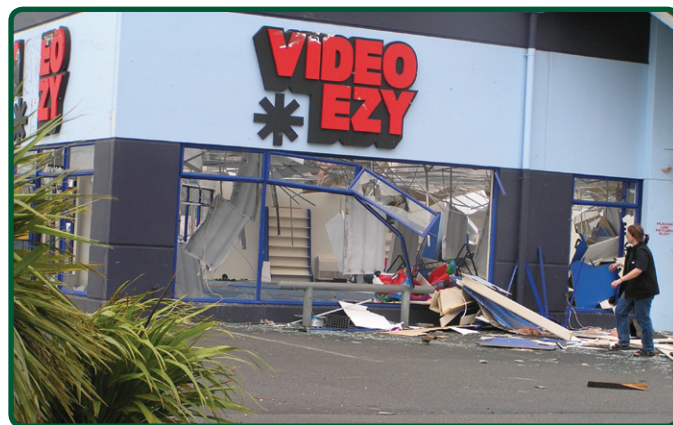
The frontage of the Video Ezy store in the main part of the town was just one of the many to be blown in.

A total of 16 houses were badly damaged or destroyed. Ten families needed accommodation. One wing of an old persons' home lost