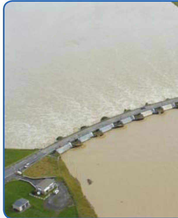
The Moutoa sluice gates (also known as the Floodgates) are situated 5 km from Feilding, stopping flooding water from the Manawatu River along a floodway. The floodway is a concrete-lined channel that stops banks on either side. The excess floodwater travels along the floodway to the sea at a rate of 3000 m 3 of water per second.

The Moutoa floodgates were open twice during the February 2004 floods, the first time on 29 February. This was a unique incident as the gates on average are closed for most of the year.