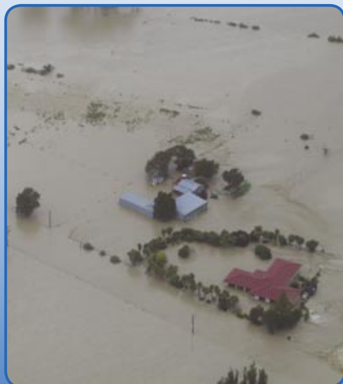
Farms throughout Manawatu-Wanganui were devastated by the storm with damage to crops and stock. Structures and crops were lost to the raging waters.