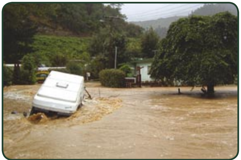
Intense rainfall, roughly 40mm in 40 minutes, caused the Waitohi River to rage through Alexander's Holiday Park near Picton. Concerns over the possible breach of the town's main dam caused the declaration of a civil defence emergency at 13:30 on 17 February 2004. Around 1000 residents and businesses were evacuated, water supply was affected, and sewage systems were damaged.

NIWA's monthly climate summaries report that a total of 30 monthly