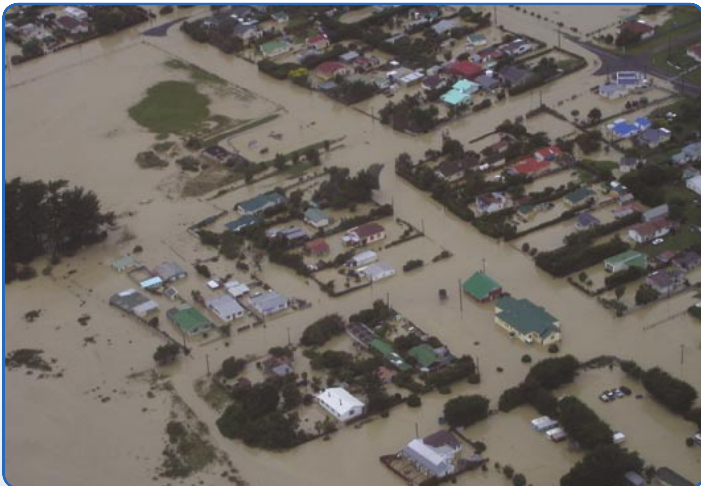
TOP AND BELOW LEFT: Run off from the Rangitikei River hit the small town of Tangimoana hard, leaving many homes and roads damaged. The floodwaters left huge deposits of silt and debris, damaging large portions of the Manawatu-Wanganui region.