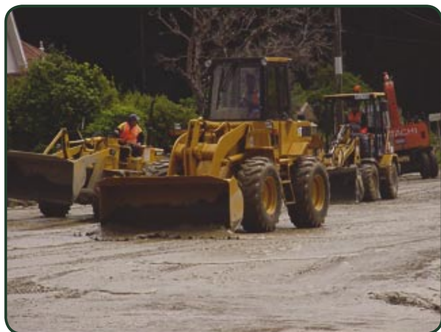
Clean up crews use heavy machinery to remove the massive amounts of silt and debris left by the floodwaters.

Government measures for the February 2004 flood emergency extend beyond those managed via MCDEM and the National Plan. Queries regarding other funding criteria need to be made to the relevant department.