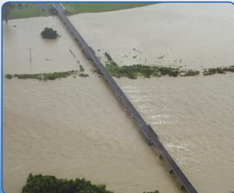
Patangata Bridge, Central Hawke's Bay with the Tuki Tuki River in flood. The HB Today paper ran a story about some tourists who were caught by the bridge and spent a night in a tree! The couple and a dog just made it out after camping beside the river.

Overall the national operations centre stood up well to the demands posed by the event. The debriefs of the event that the Ministry is undertaking will ensure that key issues are identified and improvements implemented as needed. The support provided by the wide range of agencies during this activation can also be singled out as a successful and powerful demonstration of our shared commitment to the multi-agency approach to emergencies in New Zealand.