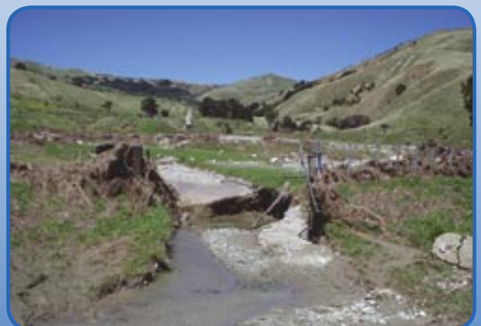
The haunting remains of a destroyed farm gate. Porangahau, in the Central Hawke's Bay, became isolated and many residents' properties were devastated by February's storm. Thirty people had to be evacuated from the township in total darkness of the early morning on 16 February 2004.