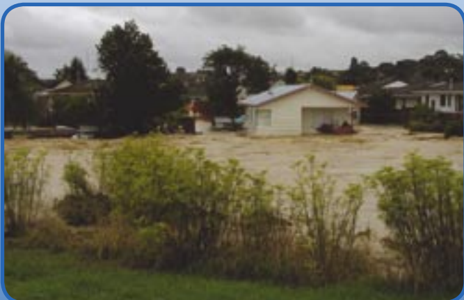
Rapid moving water, carrying large amounts of debris, overwhelmed many homes in the township of Feilding. Housing was damaged throughout the Manawatu – Wanganui region.