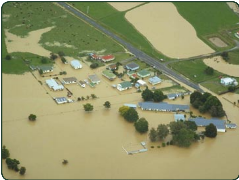
Southern Otorohanga in the Waikato. Ponding caused by unexpected overflow of the catchment behind and in the foreground Otorohanga Primary School and grounds underwater.

About 90 Turangi residents were evacuated and about 15 homes are uninhabitable from sewage contamination. Another 15 homes were evacuated at Oroutua next to the Tauranga Taupo River. Some farms have had as much as 50 acres under water and Federated Farmers distributed hay. About 30 families near Whatawhata were isolated by the Waipa River and the Waitomo caves were closed.