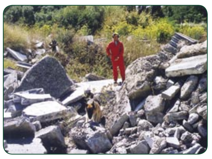
Rescue Dog Training