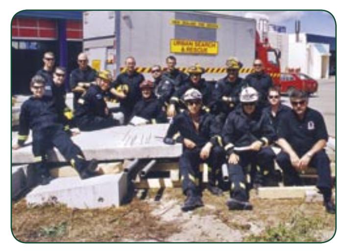
Taskforce 1 Palmerston North

We expect the above momentum to continue for the rest of the financial year and we will report on further achievements at the end of another six months. Visit www.usar.govt.nz for current updates.