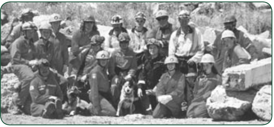
USAR Open Day at Palmerston North