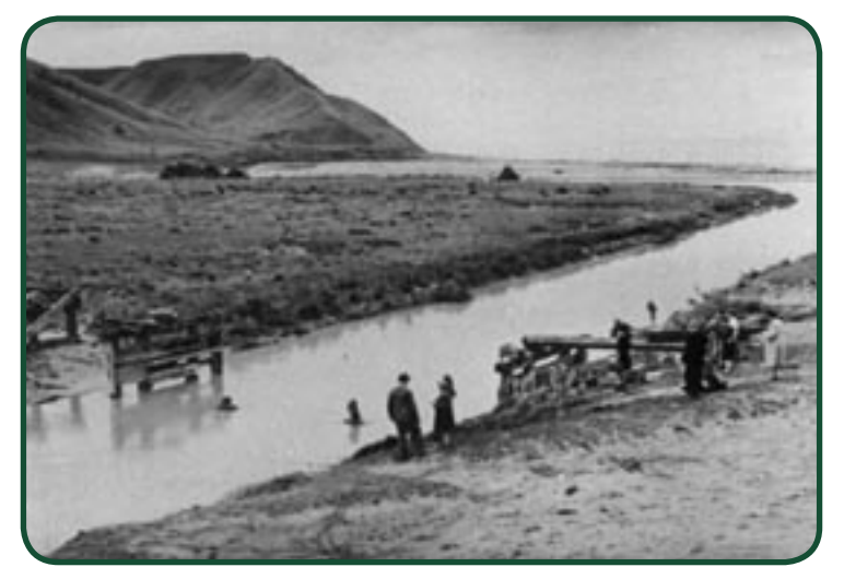
Tidal Wave, March 26, 1947: The Pouawa Bridge was swept away and the decking was washed about half a mile upstream.

The Workshop will run from 25-26 September, 2003 in Wellington and is planned as a two-day international meeting for discussing a wide spectrum of tsunami research related to understanding tsunami hazards, and developing tsunami warning and mitigation measures. The focus will be on aspects important for the South West and Central Pacific region, although other presentations are welcome.