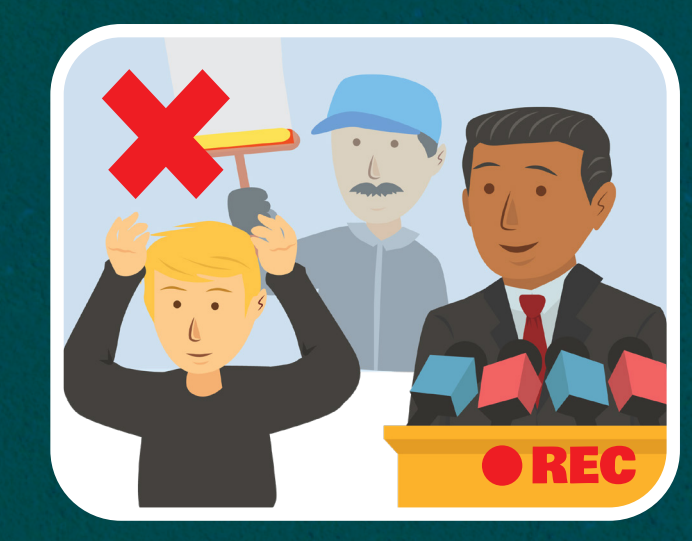
Free of distractions