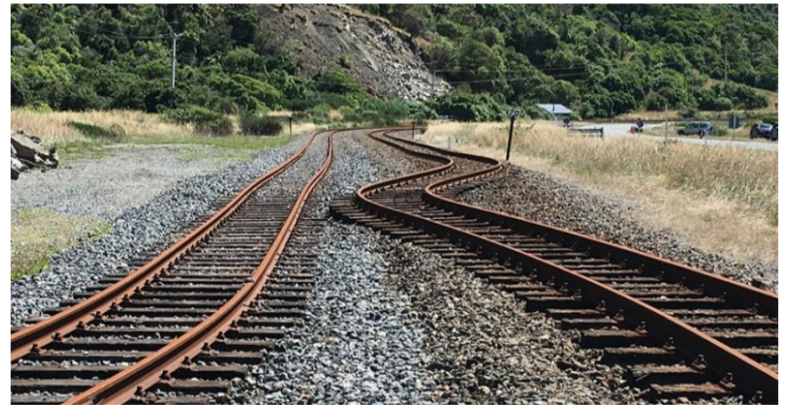
Rail Lines following Kaikōura Earthquake, 2016

A major earthquake affecting Wellington justifiably continues to receive a lot of attention as it has the potential to isolate the Wellington region by road, rail and sea and cut off water supply, electricity, gas and telecommunications for several weeks to months. Major electricity disruptions would in turn impact telecommunications capability and fuel terminals at the Port are likely to be inoperable